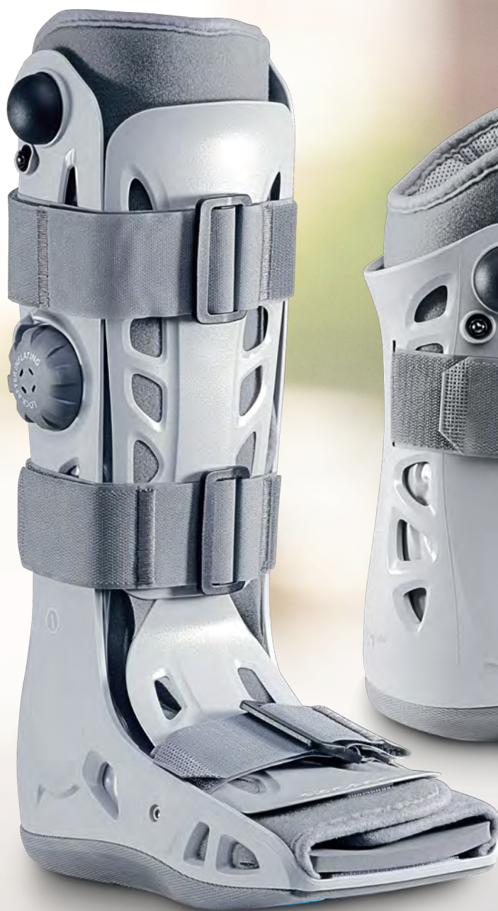
Aircast® AirSelect™ Standard