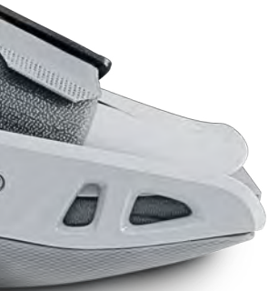
Aircast® AirSelect™ Short

The integrated inflation system lets patients inflate each aircell individually for a full-contact fit to maximize comfort; overlapping aircells minimize edema, and can aid healing. SoftStrike technology absorbs and dissipates shock, while the lightweight, lab-tested rocker sole encourages a natural gait 2 allowing a continuation of everyday activities. AirSelect offers comfort and supports faster reduction of swelling. 1 That's the ultimate combination!