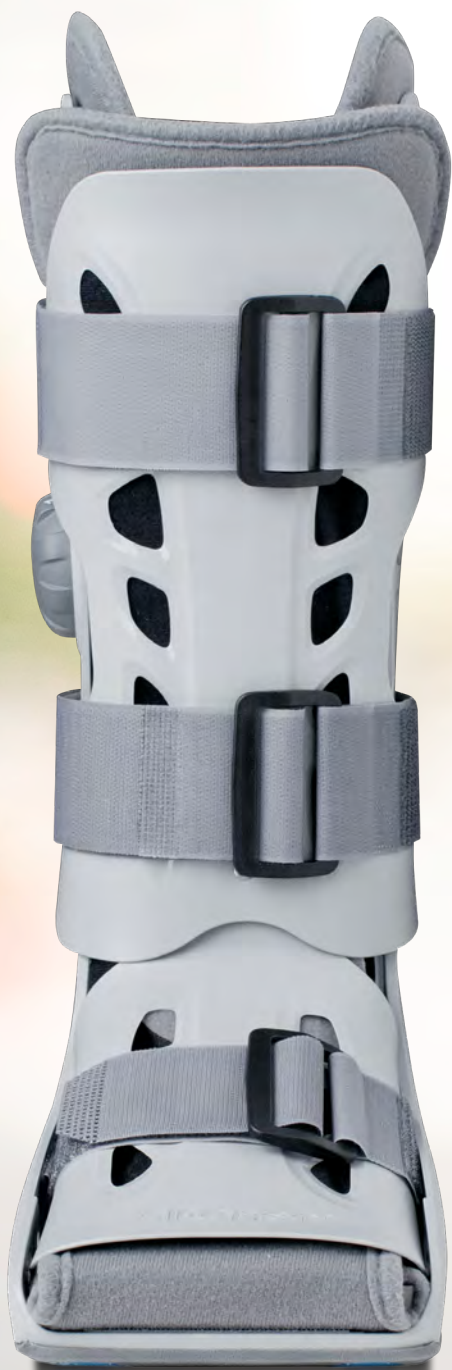
Aircast® AirSelect™ Elite